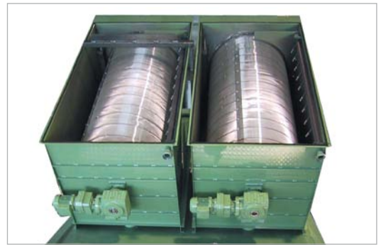
Drum sieve with stainless-steel sieves and nozzle carrier

Using different stainless-steel fabrics enables different separation rates. Flow rates and the purification level achieved depend on the fabric quality used and the viscosity of the filter medium. Purification levels up to 99% can be achieved with a limit grain size of 30, 50, 100, 150, 200 or 300 \mu\text{m} . As a rule, this filter system is used as a coarse or pre-filter or for filtering flushing liquids. This system is especially suitable for the separation of machining chips of almost all types of materials. The separation of hydraulically pumped chips is also possible in particular. Chips are not pumped into the tank but already separated above the liquid level. This filter method is preferable above all others particularly with floating chips. Combination with different other fine filter systems to create a multi-stage filtration system is also easily possible.