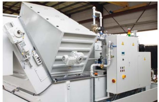
Drum sieve on combined system