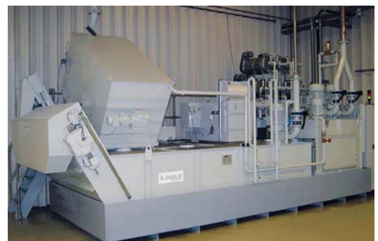
Drum sieve filter as coarse and pre-filter